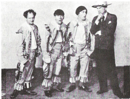
TED HEALY and his three Southern Gentlemen

The team of Ted Healy and his Stooges did well in vaudeville and appeared in several Broadway revues, such as the legendary "Earl